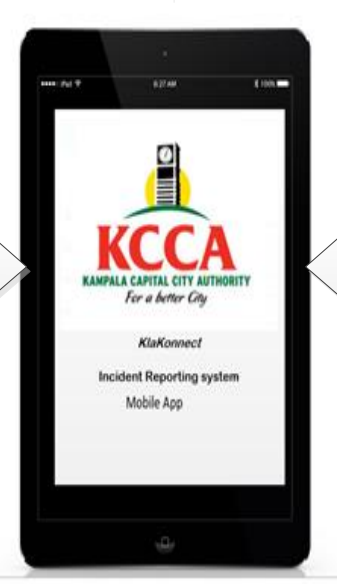
KlaKonnnect Incident Reporting tool

Action: Klakonnnect incident reporting tool