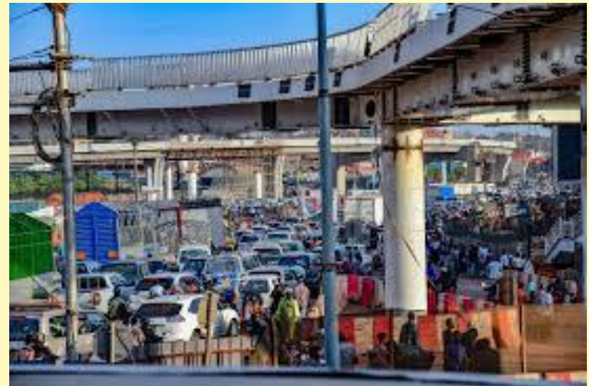
Flyover project area: internet photo